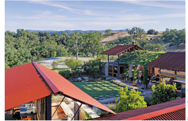
Touche Pass Residence

Texas Medal of Arts, 2009 Texas Society of Architects Firm Award, 2004 Lake|Flato has received 45 Texas Society of Architects design awards—more than any other Texan firm. AIA Indiana Outstanding Architecture Award, 2008 AIA Kansas, 2004 AIA San Antonio Awards, Lake|Flato has received over 80 AIA San Antonio design awards.